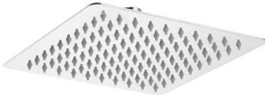
BA-001 Mirror Polished