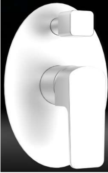
Part No: DWG-TDSM-4101 Chrome