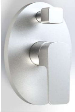
Part No: DWG-TDSM-4101 Chrome