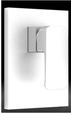
Part No: DWG-SLSM-3101 Chrome