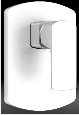
Part No: DWG-SLSM-3101 Chrome