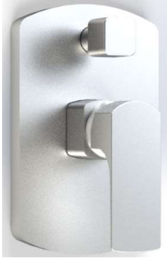
Part No: DWG-TDSM-4101 Chrome