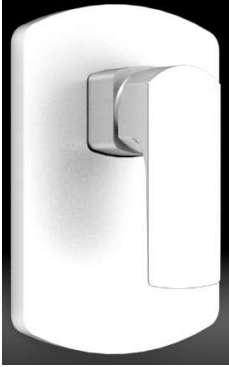
Part No: DWG-SLSM-3101 Chrome