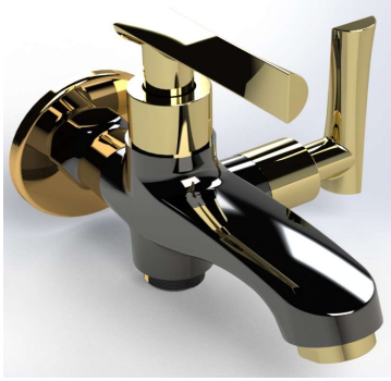
Part No: DWG-PTB-103 Black & Gold