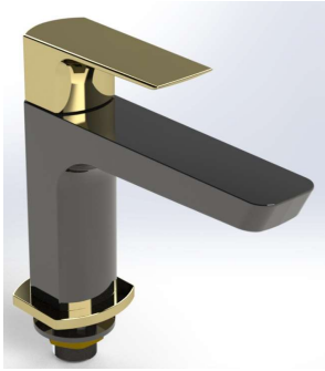
Part No: DWG-FPCR-702 Black & Gold