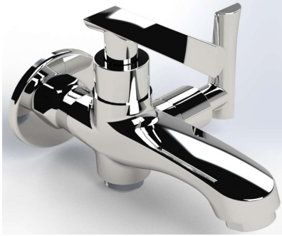
Part No: DWG-PTB-103 Chrome