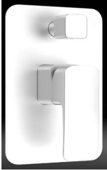
Part No: DWG-TDSM-4101 Chrome