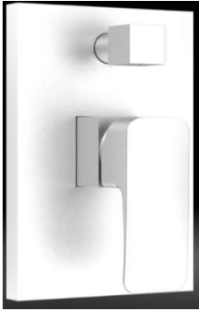
Part No: DWG-TDSM-4101 Chrome