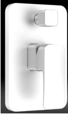
Part No: DWG-TDSM-4101 Chrome