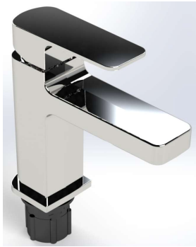
Part No: DWG-BMSE-660 Chrome