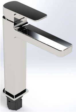
Part No: DWG-BMTE-220 Chrome